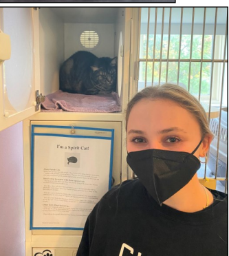
Minx with her new mom!

make great companions for people with limited time to devote to a