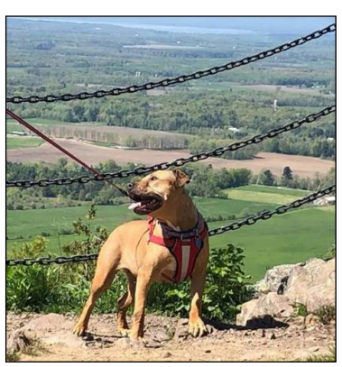
Hiking Mount Philo