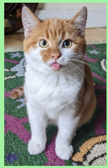
had diabetes insipidus - a rare illness that can occur when head trauma disrupts the function of the hypothalamus or pituitary gland.

Elliot was fostered by one of our shelter veterinarians, who noticed that he was drinking and urinating more than a typical kitten. Bloodwork revealed that he